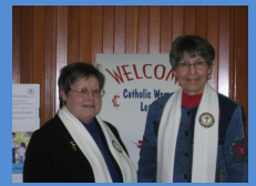
League Sisters proudly wear the CWL stole

Our Membership Drive was held the weekend of January 21/22, 2012.