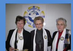
After each Mass the CWL hosted coffee for the parish