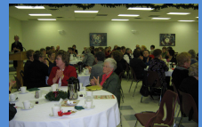
A very enjoyable evening was well-attended by League Sisters & guests